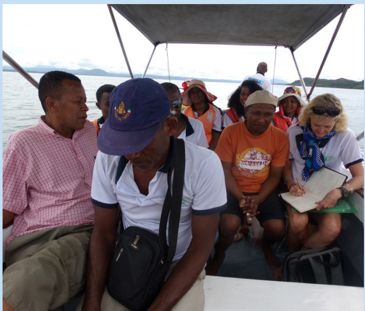
Director of the Sahamalaza and Radama Islands Park boat interview