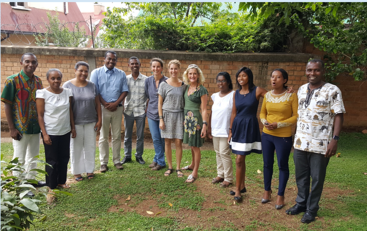
MTR reviewer and the GEF National Partner representatives

Visit of two projects sites among the five ones Managed by two national partners.