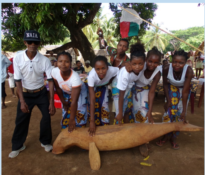
Nosy Berafia Women association