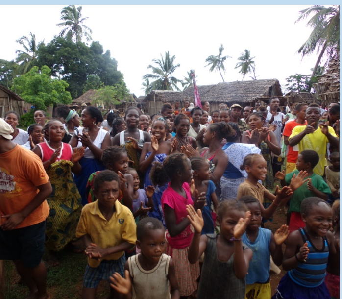
Traditional welcoming to the MTR team