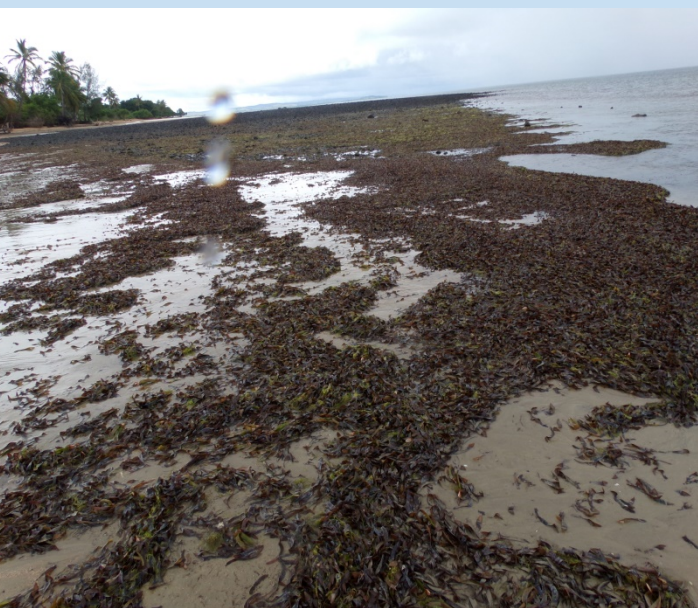
Wrecked Seagrass at Ankasetra seashore