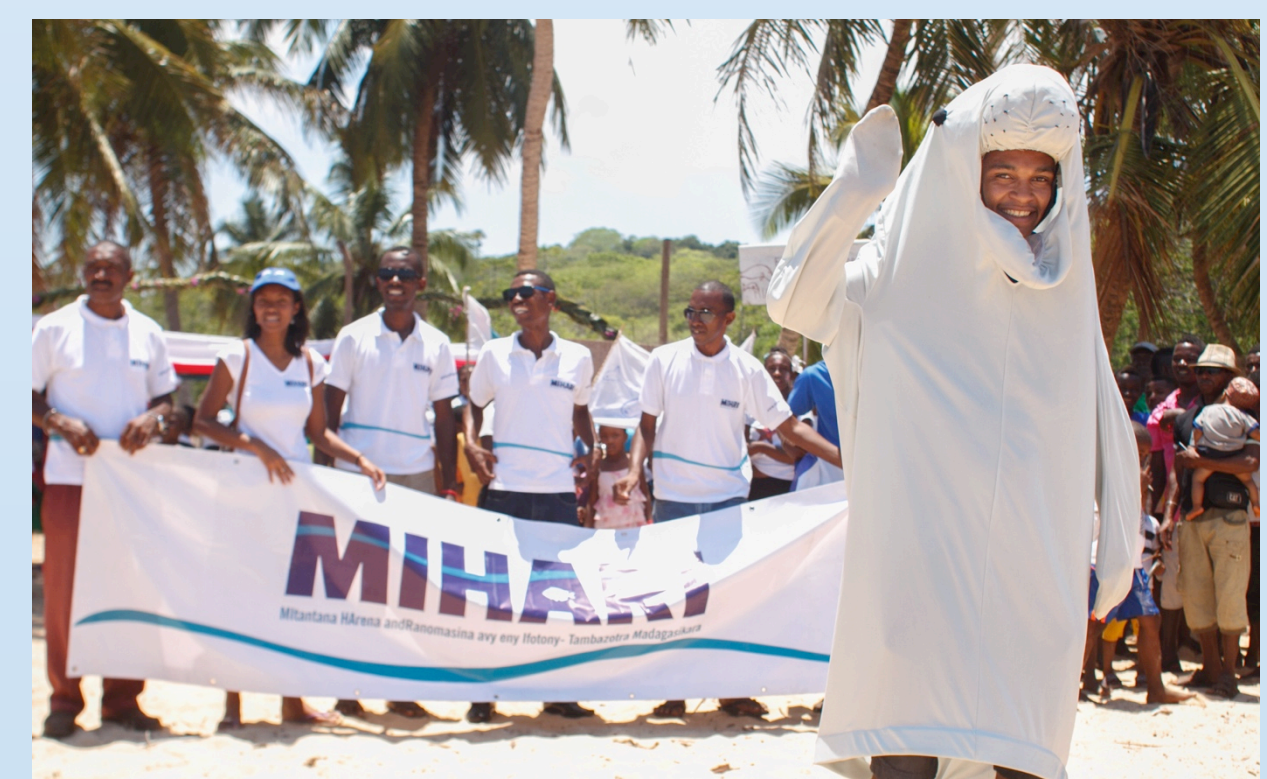
MIHARI was invited to the dugong festival at Nosy Hara

Public awareness on the importance of dugongs and seagrass during Madagascar's third national days of fisheries and aquaculture in September 2017.