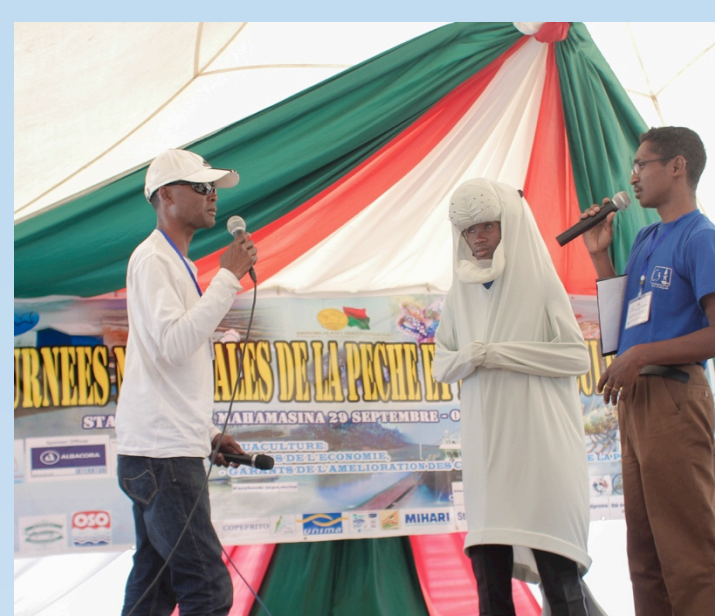
Sketch, created by C3, on importance of dugongs