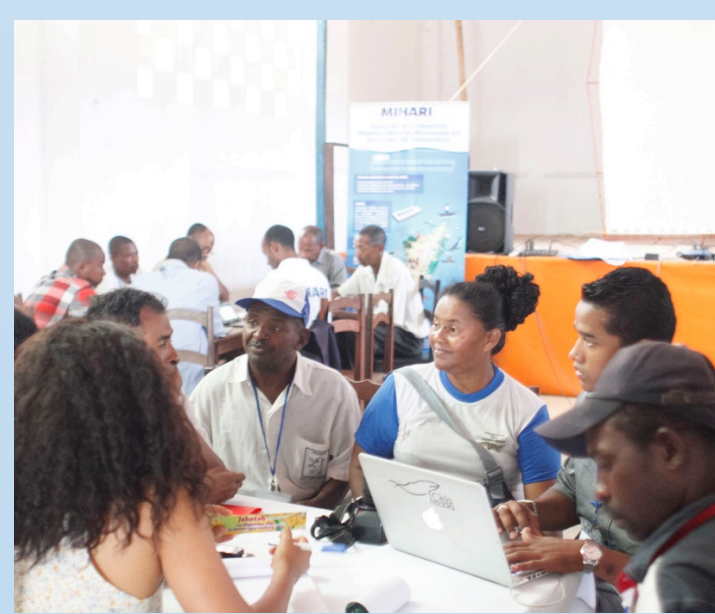
Group workshop at NW regional forum