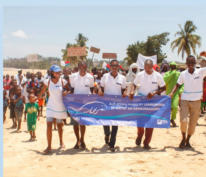
Celebrating protection of dugongs at the festival