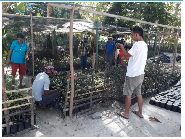
Nursery garden of mangrove (KCP)