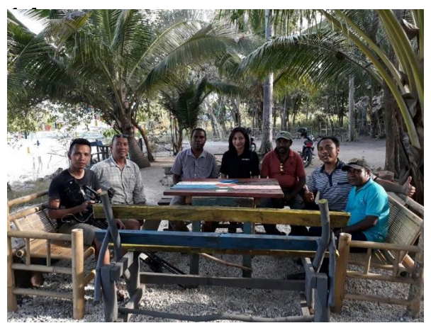
Metro TV team with WWF Indonesia Staff and Marine and Fishery Agency of Alor