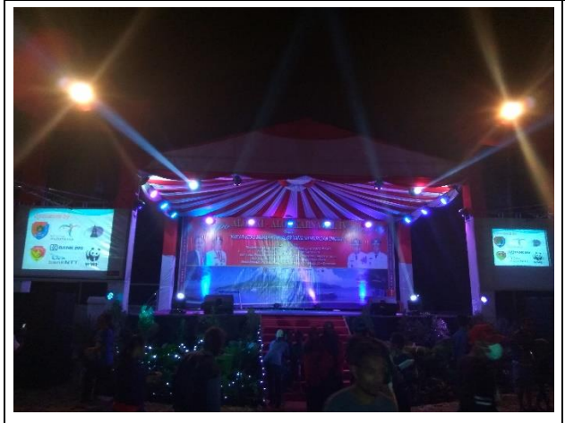
Alor Expo and Carnival 2017