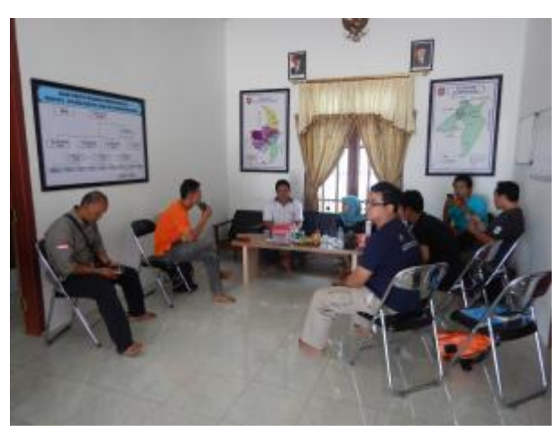
Figure 2. Coordinating with kubu head of village