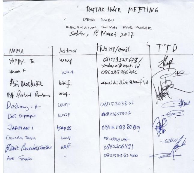
Figure 11. Discussion in Kubu village