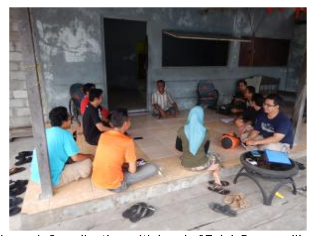
Figure 4. Coordination with head of Teluk Bogam village