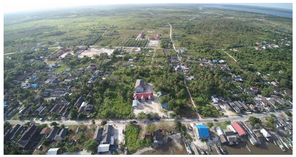
Gambar 9. Center of Kubu Village Government