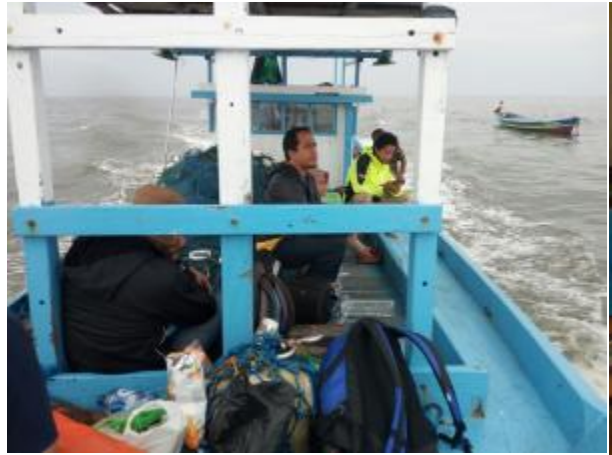
Figure 5.heading to Gosong Beras Basah by boat