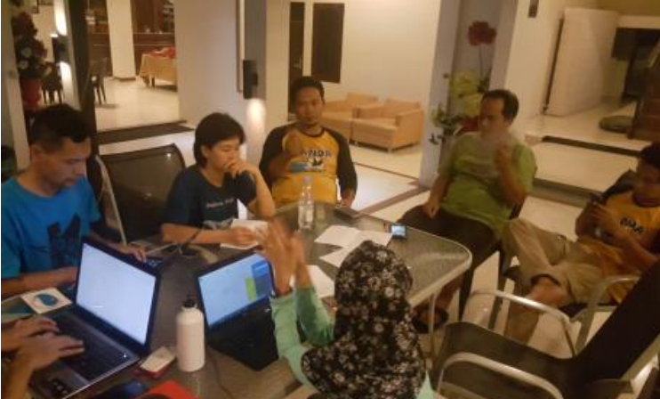
Figure 6. Night discussion on the last day in Pangkalan Bun