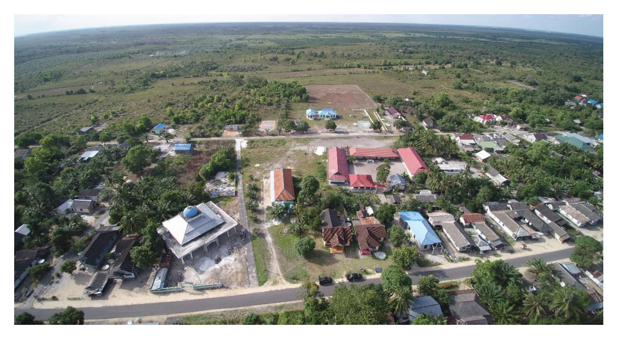
Figure 8. Center of Sei Bakau Village Government