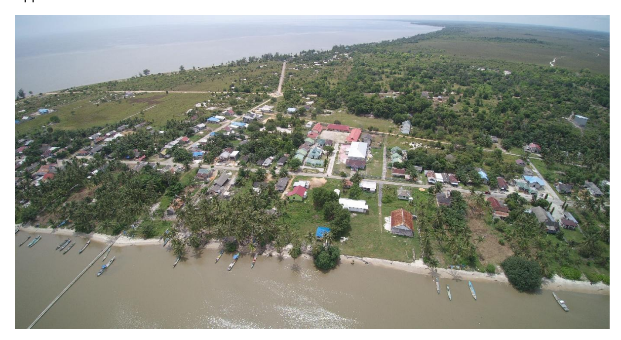
Figure 7. Center of Teluk Bogam Village Government