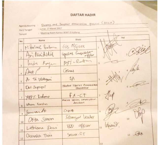
Figure 10. DSCP Indonesia Socialization and consolidation in WWF Kalteng